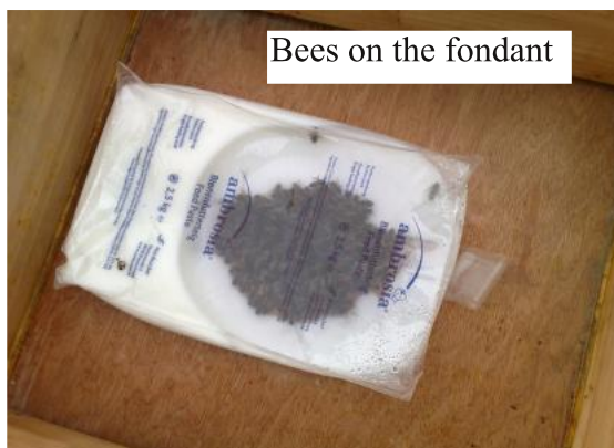
Bees on the fondant

As the winter continues our bees are surviving on diminishing stores. To ensure their survival through to the spring a check at this time of year is essential. Hives should be hefted and any light ones must be given help.